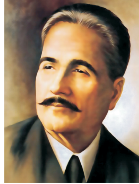
Allama Muhammad Iqbal National Poet

لب پہ آتی ہے دعا بن کے تمنا میری زندگی شمع کی صورت ہو خدایا میری دور دنیا کا مرے دم سے اندھیرا ہو جائے ہر جگہ میرے چمکنے سے اُجالا ہو جائے ہو میرا کام غریبوں کی حمایت کرنا درد مندوں سے ضعیفوں سے محبت کرنا میرے اللہ بوائی سے بچانا مجھ کو نیک جو راہ ہو اسی راہ پہ چلانا مجھ کو لب پہ آتی ہے دعا بن کے تمنا میری زندگی شمع کی صورت ہو خدایا میری